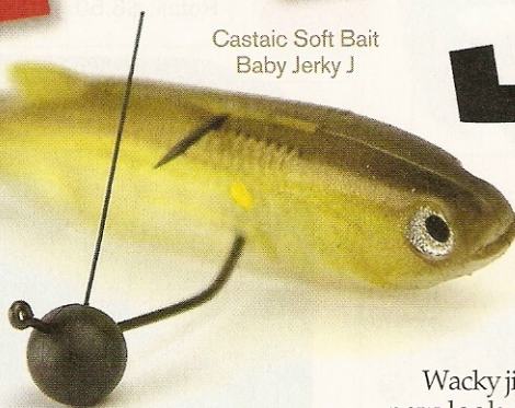
Castaic Soft Bait Baby Jerky J

Last summer, success stories began to circulate about wacky-rigging thin worms on finesse jigheads, enabling anglers to catch bass when other techniques failed. Toward the end of the season, I obtained the specialized heads and worms, along with many tips on their use, and eagerly tried them out. I was amazed to catch largemouth and smallmouth bass nearly everywhere I tossed this rig, on my first trip.