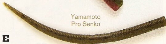
Yamamoto Pro Senko