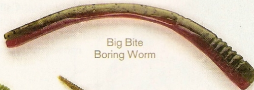
Big Bite Boring Worm