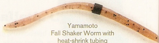
Yamamoto Fall Shaker Worm with heat-shrink tubing